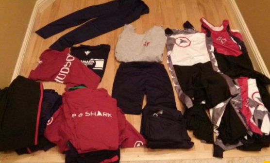
Older but never worn Regatta Sports gear