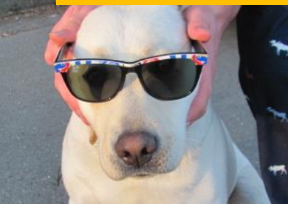
Yes that's an erg